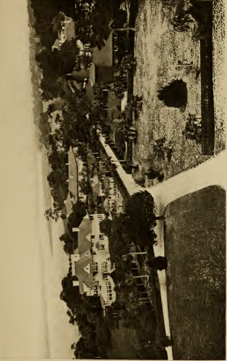
FROM CLUB HOUSE LOOKING NORTH